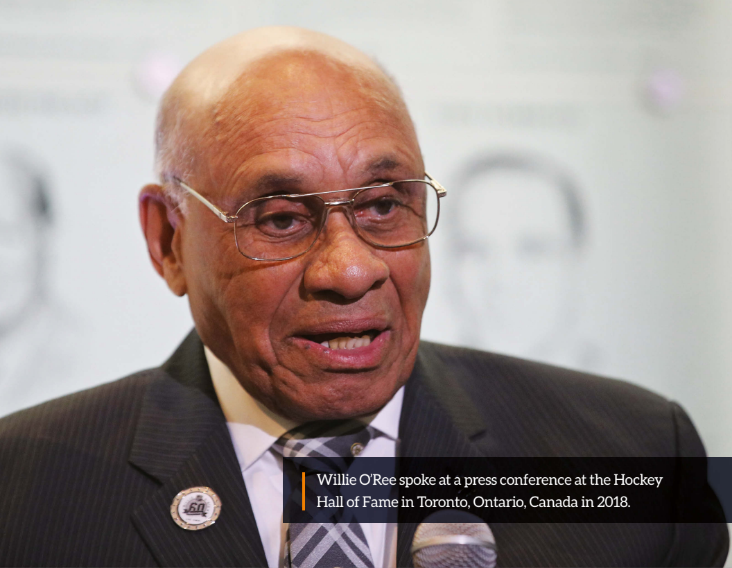
Willie O'Ree spoke at a press conference at the Hockey Hall of Fame in Toronto, Ontario, Canada in 2018.