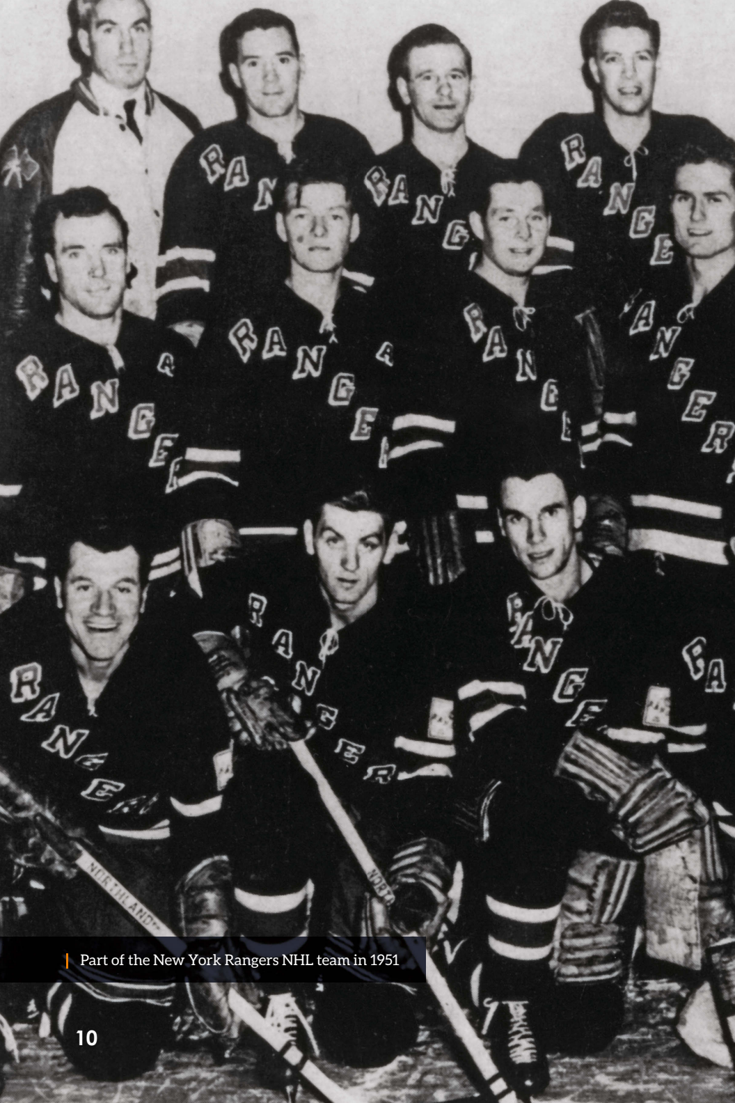
| Part of the New York Rangers NHL team in 1951