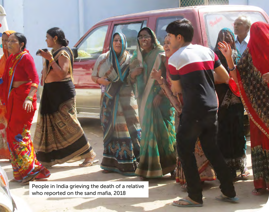
People in India grieving the death of a relative who reported on the sand mafia, 2018