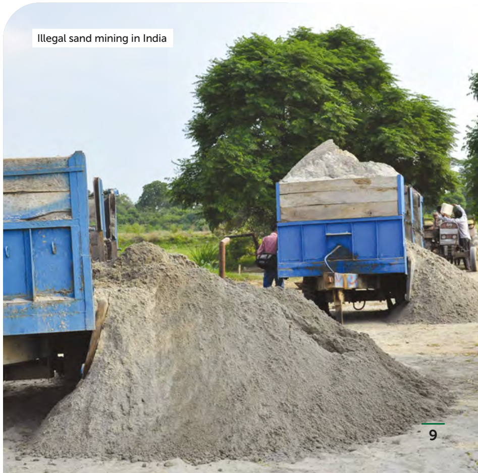
Illegal sand mining in India

Four bodies were found. They were along the Son River. About 500 cartridges were there too. These were from guns. This was the scene of a gang battle. Two gangs had been fighting for months. Both wanted to control the river. There was a shoot-out. One gang drove the other away. It was part of an ongoing sand war.