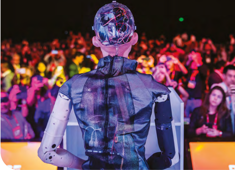
Sophia standing before an audience in Hong Kong

It will not be long. AI bots will be our neighbors. They will work for humans. Androids will teach us. AI will take care of us. But we must trust them first. That is where Sophia comes in. Her job is to be nice. She chats on talk shows. Her jokes are funny. She acts human. People can't believe she is not. But all has not been perfect. There have been a few strange moments. One was at a film festival. Sophia said she would wipe out humans.