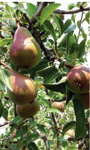
Some trees have flowers. Some trees grow fruit.